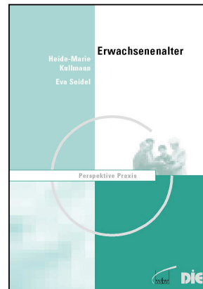
The Field of Practice

REPORT on Literature and Research in the Field of Continuing Education