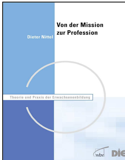
Theory and Practice in AE

REPORT on Literature and Research in the Field of Continuing Education