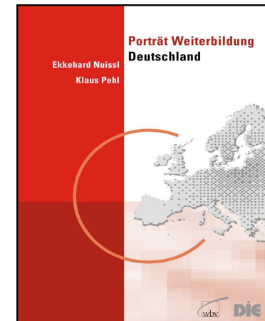
Continuing education: country reports